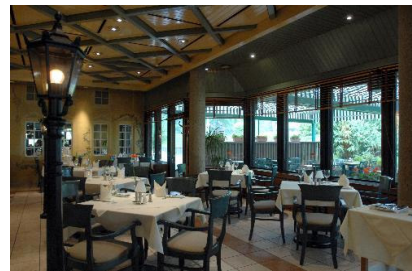
congress- & restaurant area